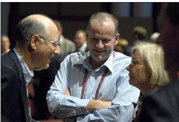
Stream Session - Future of the Australian Economy

This stream advocated a fundamental commitment to creating a seamless national economy and single national markets in major areas of economic activity (for example, labour, energy, water, transport and communications). The goal should be to minimise overlaps and bottlenecks and improve competitiveness. They will require clarification of roles, responsibilities and accountabilities between different levels of government. At present, however, Australia's economy in major markets is highly fragmented: the COAG national reform process has identified more than 25 areas in which Australia has eight sets of different State and Territory regulations. In addition, we have multiple education and accreditation systems. A country of Australia's size cannot afford this.