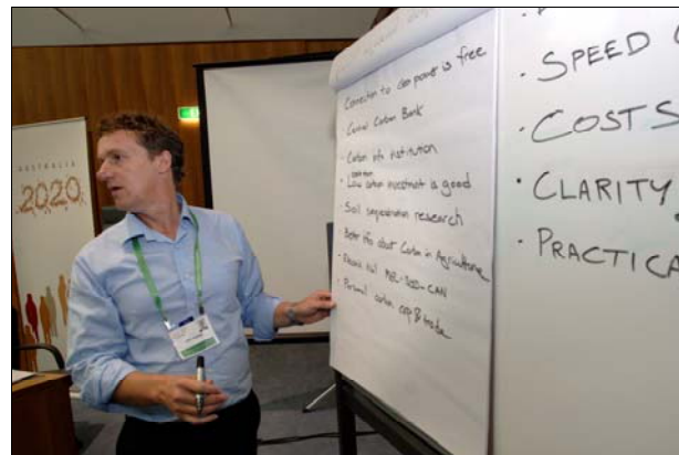
Stream Session - Population, Sustainability, Climate change, Water and the Future of our Cities

By 2020 the health of Australia's ecological systems will be improved. The health of our river and groundwater systems will be managed to achieve ecological sustainability, supporting food and fibre production and resilient communities. Australia will also have become a global leader in tropical water system conservation and sustainability.