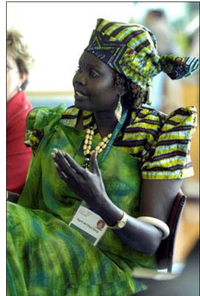
Stream Session - Australia's Future in the Region and the World

Some submissions suggested that Australia should adopt a more neutral foreign policy posture. A substantial number of submissions emphasised the importance of developing more intensive links with China and India. Several submissions made the point that diplomacy, peacekeeping, engagement with civil society and the development of international norms, principles and rules were more relevant to Australia's security in the future than the use of military power.