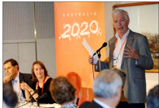
Stream Session - A Long-term National Health Strategy

This stream was characterised by five key themes. Participants stressed the importance of healthy lifestyles, health promotion and disease prevention. A related theme was the need to address health inequalities (including lifestyle factors) within and across communities. The health workforce and service provision were seen as key enablers for a healthy population. Much discussion centred on the future challenges and opportunities in health – and the role of health research, research translation and research training in addressing these.