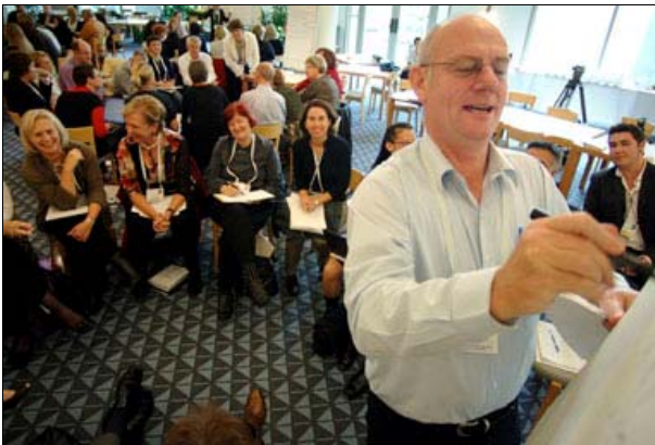
Stream Session - Strengthening Communities and Supporting Working Families

Participants in this stream also proposed specific ways of reducing the damage inflicted on communities by problem gambling and binge drinking. These could include reducing the number of poker machines or tighter regulation of alcohol.