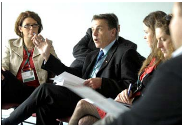
Stream Session - Australian Governance

Much was made of the need to fix federalism to create a modern Australian federation.