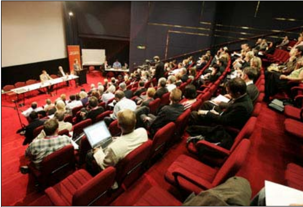
Stream Session - The productivity agenda - education, skills, training, science and innovation

Higher levels of information and globalisation create unprecedented opportunities to increase productivity growth. Productivity growth requires excellent social and physical infrastructure, flexible, fair and equitable labour markets, and a world leading education and innovation system.