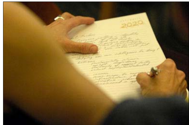
Stream Session - Towards a Creative Australia

Other major topics included government support, television content, accessibility and design.