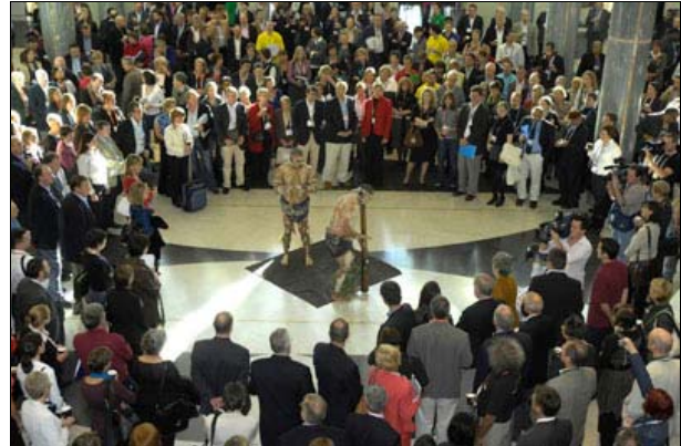
Participants Arrival and Welcome

There is a sense of a nation at a significant point in history, where shifting global balances of economic power will affect Australia's place in the world. There is a great opportunity in the shift of economic power to Asia and the Pacific – provided we use our geography, economy and cultural resources to create and nurture profound links.