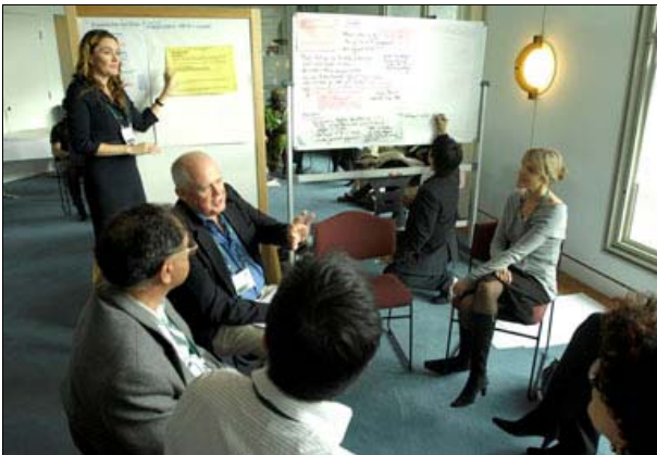
Stream Session - Australia's Future in the Region and the World