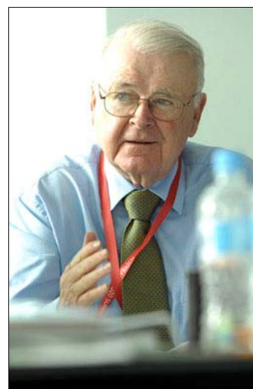
Stream Session - The Future of Australian Governance

Another major theme was the human rights agenda – with many submissions supporting an Australian Bill of Rights or Charter of Rights either in the Constitution or in legislation. This included discussion of legal reform (e.g. legal enshrinement of basic freedoms) and structural safeguards (such as government review mechanisms and a fair and transparent justice system). Many submissions stressed the need to continue vigorously supporting the role of women and Indigenous people in Australian governance.