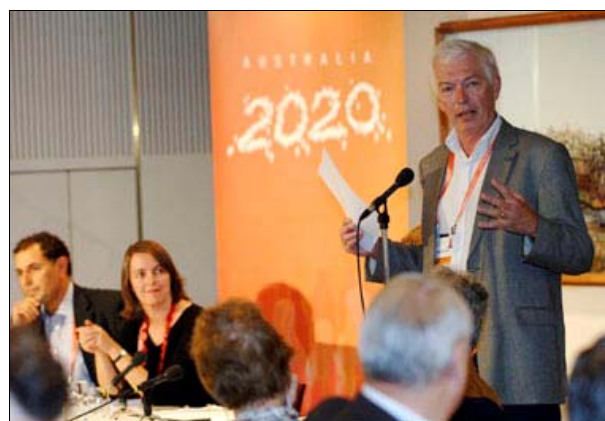
Stream Session - A Long-term National Health Strategy

This stream was characterised by five key themes. Participants stressed the importance of healthy lifestyles, health promotion and disease prevention. A related theme was the need to address health inequalities (including lifestyle factors) within and across communities. The health workforce and service provision were seen as key enablers for a healthy population. Much discussion centred on the future challenges and opportunities in health – and the role of health research, research translation and research training in addressing these.