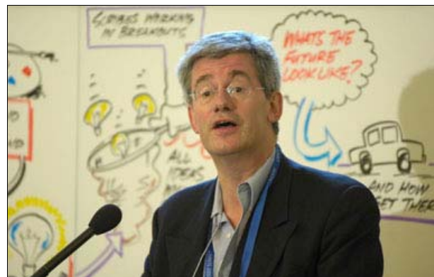
Stream Session - Towards a Creative Australia

The stream also discussed the increasing importance of creativity in the new economy, both at home and abroad. This is central to innovation in the new industries which are fuelled by creativity and draw on the arts, entertainment and design. This will present both opportunities and challenges as traditional models of income support change. Success in this new environment demands that creativity is embedded in our education systems, economy and international representation at every level.