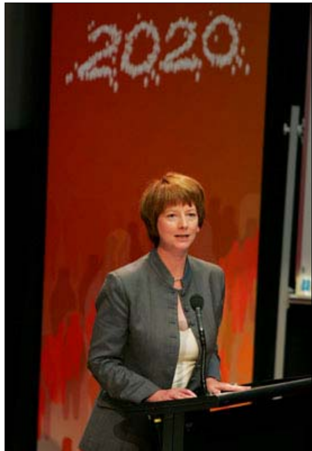
Stream Session - Future of the Australian Economy

The submissions also highlighted the need to attract and retain talented, creative and highly skilled people (including researchers and scientists, entrepreneurs and professional skilled workers) in the context of the global 'war for talent'.