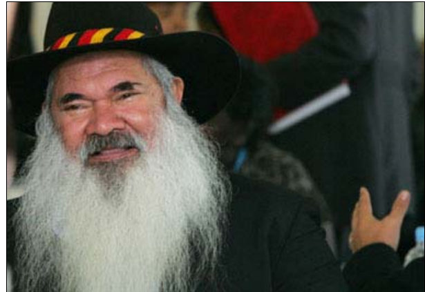
Stream Session - Options for the Future of Indigenous Australia

There was wide support for new, independent mechanisms with teeth and sanctions to monitor accountability of governments, involving significant Aboriginal and Torres Strait Islander representation.