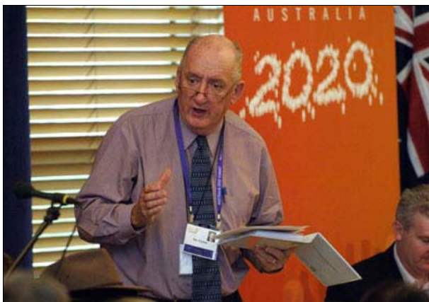
Stream Session - Future Directions for Rural Industries and Communities